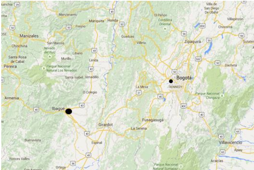
Figure 1. Location of the Municipality of Ibagué – Tolima.

The project is located in the city of Ibagué, capital of the Department of Tolima, located 210 kilometres west of Bogotá (Colombian capital), on a sloping terrace, which is part of one of the buttresses of the Cordillera Central.