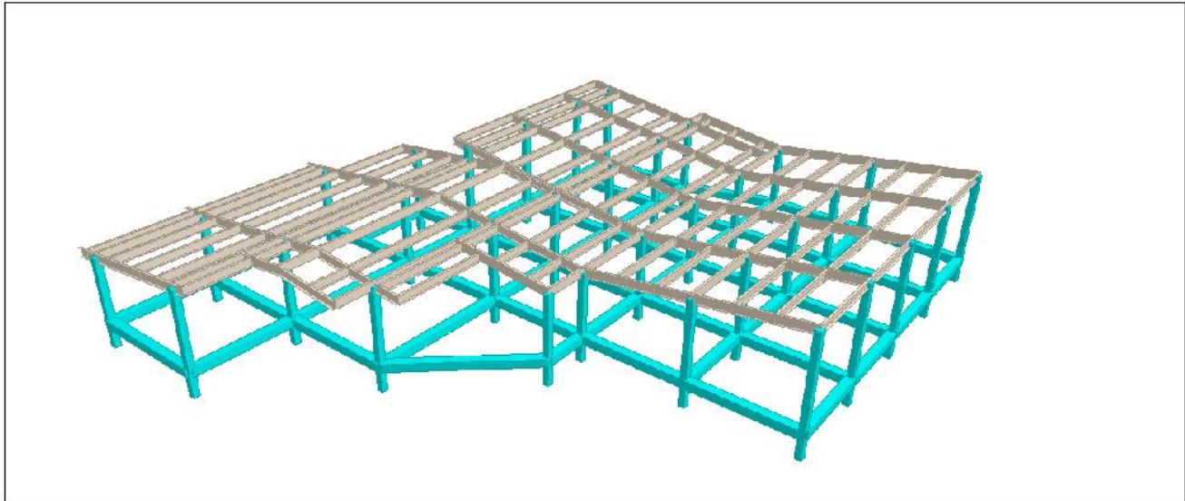
3D Rendered View